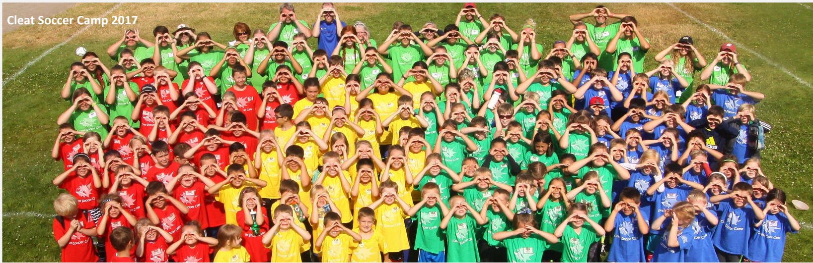
Cleat Soccer Camp 2017